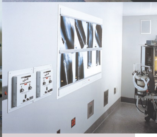
Full integration of instruments | Corian® works well as part of a dream-team. Ultraadaptable it can be easily integrated with all kinds of other materials and technologies for optimum conditions. | Corian® Hospital wall with integrated technology

Hygiene in good shape | One-piece, flowingfree and resistant to unwelcome contaminants, this pleasingly colourful scrub room washbasin helps to keep hospital hygiene in great shape. Corian<sup>®</sup> Hospital