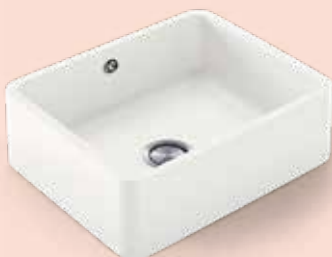
→ Integrity Q 51 x 41 x 15.5 cm Radius 3cm