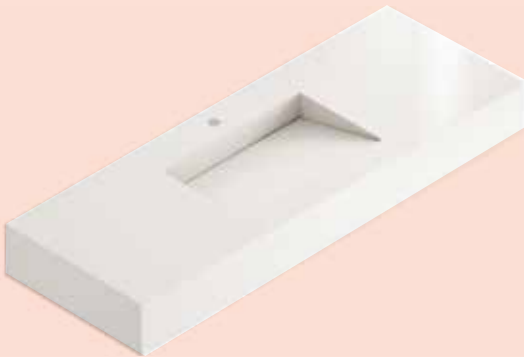
→ Armony Basin 49 x 30 x 10 cm