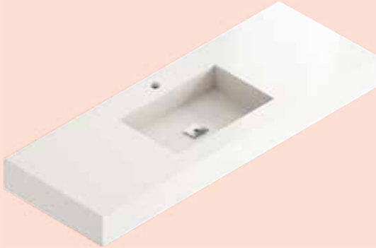
→ Elegance Basin 49 x 30 x 10 cm