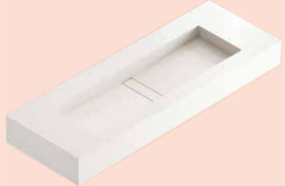
→ Reflection S Basin 49 x 30 x 8 cm M Basin 90 x 30 x 8 cm L Basin 120 x 30 x 8 cm