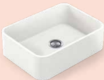
→ Integrity DUE XL 67 x 43.5 x 21 cm Radius 6.5cm