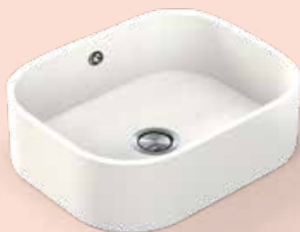
→ Integrity ONE 51 x 41 x 15.5 cm Radius 13cm

Integrity Q is our new sink featuring a monolithic, minimalist design.