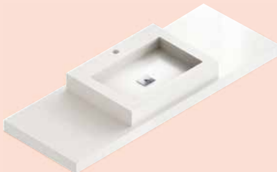
→ Symmetry S Basin 33 x 23 x 7 cm M Basin 38 x 25 x 7 cm L Basin 58 x 30 x 7 cm