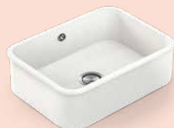
→ Integrity TOP 51 x 37 x 15.5 cm Radius 6.5cm