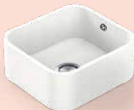
→ Integrity DUE S 34 x 37 x 15.5 cm Radius 6.5cm