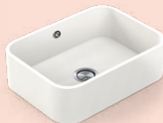
→ Integrity DUE L 51 x 37 x 15.5 cm Radius 6.5cm