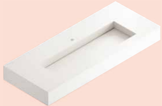
→ Silence S Basin 49 x 30 x 8 cm M Basin 90 x 30 x 8 cm L Basin 120 x 30 x 8 cm